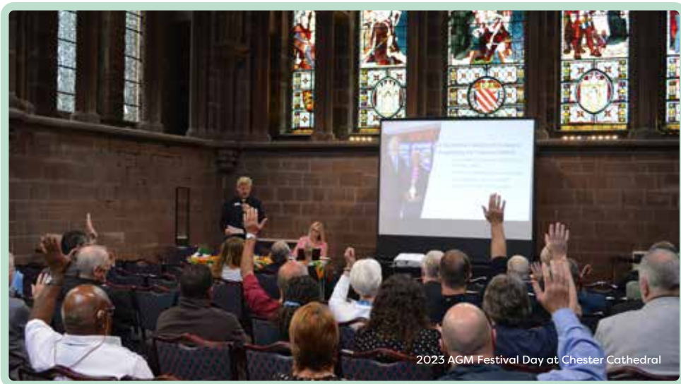
2023 AGM Festival Day at Chester Cathedral

During the year, the email newsletter had a steady circulation of around 350 contacts. The charity continued to organise online events, and also strived to provide speakers for Sunday services, parish, and school talks. Based on supporter feedback, the AGM and Festival Day was held at Chester Cathedral, with the option to join online. As a Christian community and family, MMUK cherished every opportunity to meet with supporters.