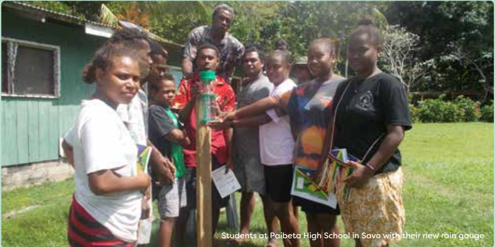
Students at Paibeta High School in Savo with their new rain gauge

Over the last year, MMUK has successfully expanded its adaptation, education and awareness raising activities with respect to climate change in Melanesia.