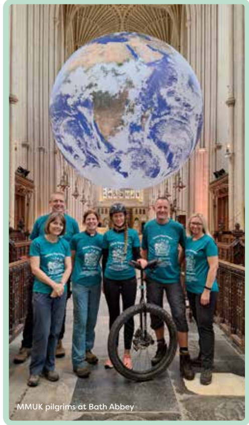
MMUK pilgrims at Bath Abbey

Encountered 100 people along the pilgrimage